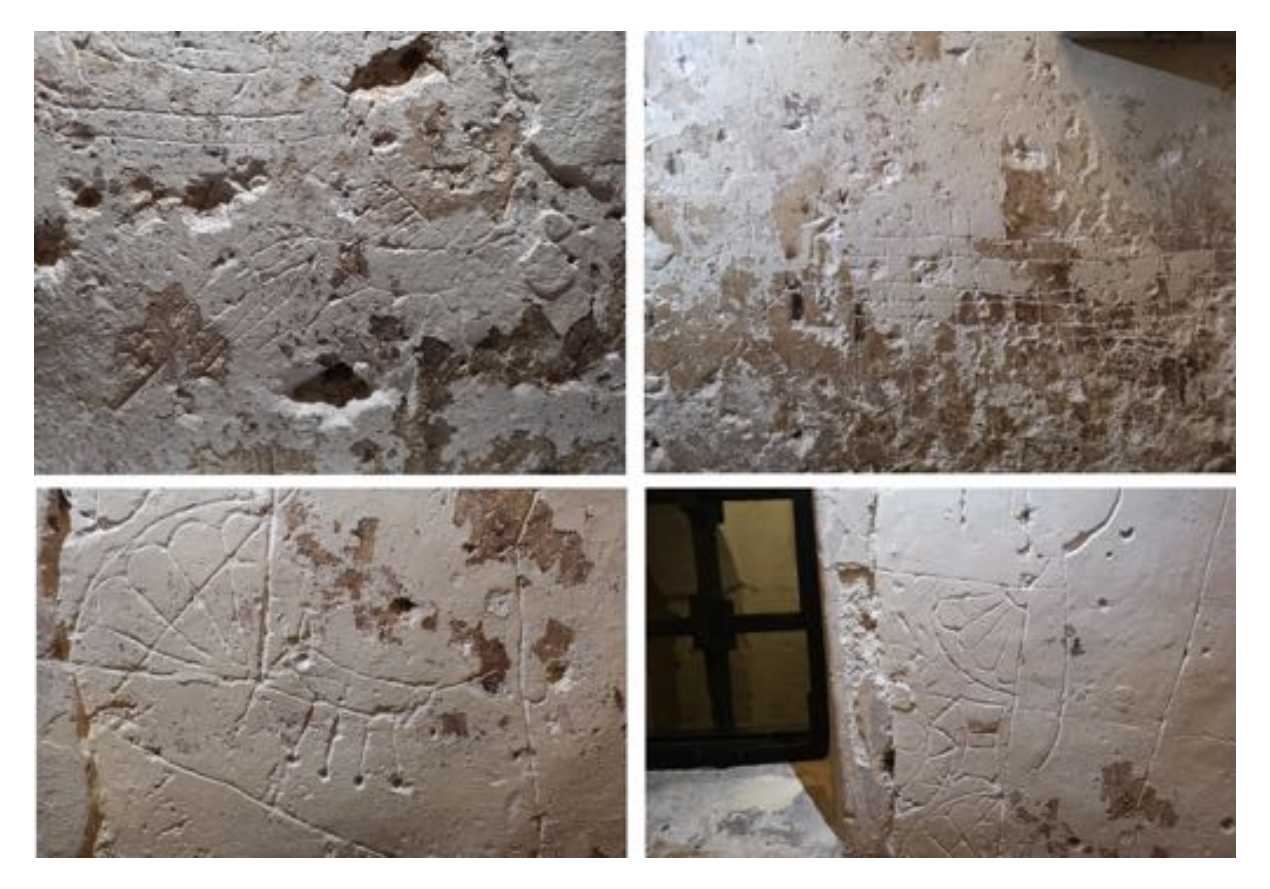
Fig. 6. Clockwise, from top left: Marking making in the gaol cells at York Castle Museum. An ornate bird, the gaol itself, hunting dog, architectural detail.

the torch (a modified hardware assembly containing a torch and an HTC Vive controller) through the space. The experience was implemented within Unity with users able to activate audio files by pointing the HTC Vive Controller at an audio source aligned with the graffiti in the room. Pointing at an audio source would cause a sound to quickly 'fade in' while moving the controller away would cause it to quickly 'fade out' again. Directional sounds were produced using a set of surround sound speakers hidden within the room. The experience was powered by a PC placed outside of the room.